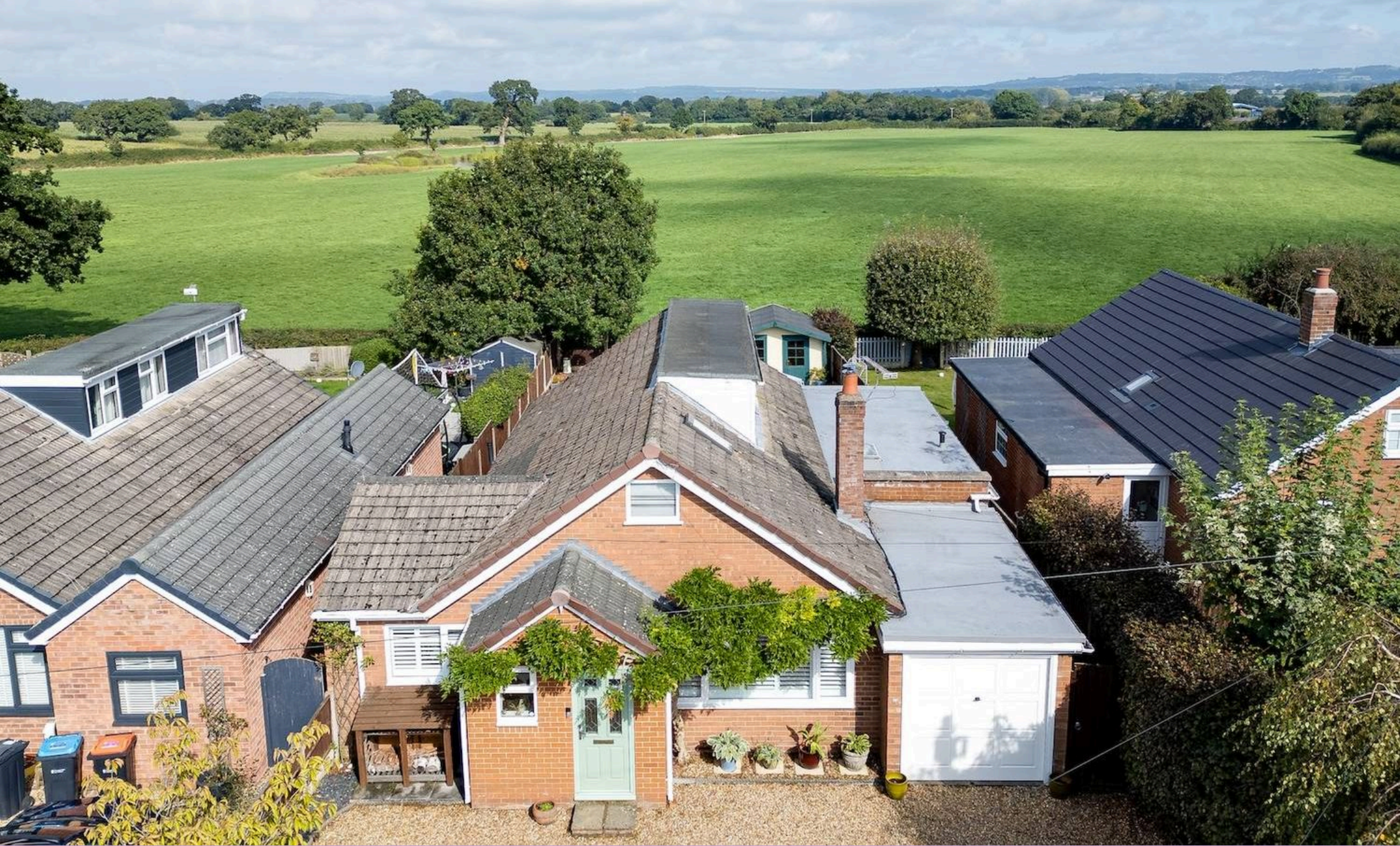
24 Greenfield Crescent, Waverton £475,000